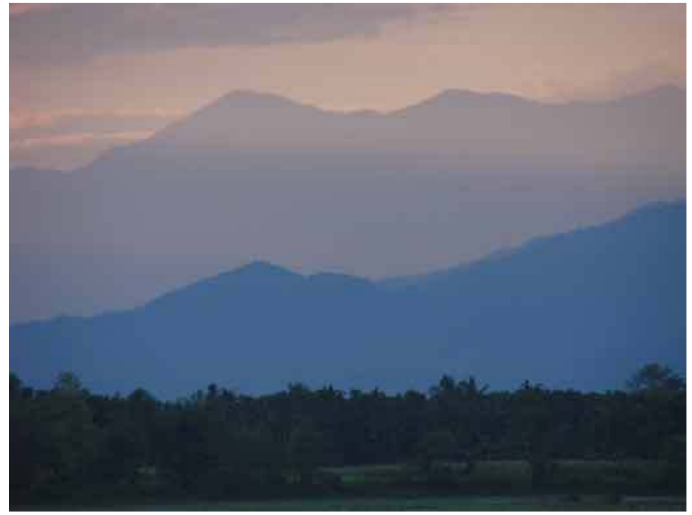
Each year the crisis comes back!

For perhaps understandable reasons the closed units are getting a lot of attention since 2003-04. After all, incidents of starvation and death deserve the spotlight. Little however is being said about the condition of these gardens when they were still open. It is evident that the situation was not too bright even then. Malnutrition was there – just that it became worse after closure. It is worth mentioning that unlike in closed industrial units located in urban areas, there are almost no other economic pursuits worth mentioning.