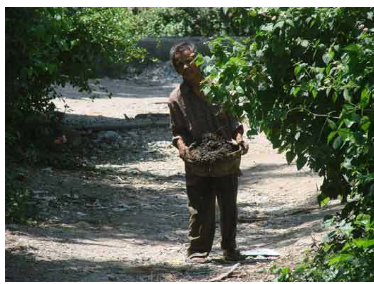
Doing anything to scrape a meal...

Alternatives are suggested, 'projects' prepared and funds requested. Meanwhile 'new' owners are coaxed, wooed and cajoled to 'reopen' the closed units. These owners decline to open the units in face of liabilities that run into crores. They agree 'reluctantly' to pick leaves and sell them to 'bought leaf' plants very often in support of Operative Management Committees. Their 'seemingly humanitarian' gesture guarantees at least a subsistence allowance for the jobless workers.