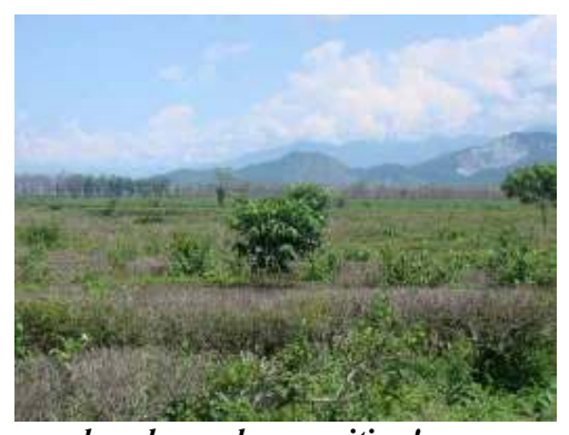
A decade of disregard could perhaps degrade tea gardens beyond recognition!

Even in such estates where there are no 'new' owners, OMCs run the same show but more often than not a 'leaf buyer' in the shadow acts as the financier and a 'by-default' owner. Even as plucking goes on at every single 'closed' tea estate, not a single tea factory attached to these tea gardens reopen. Neither are new plantations set up, nor are there any attempts to maintain and look after the old and ageing bushes. When all the leaves are plucked crisis deepens in most gardens. Few retain their jobs and the number of unemployed soar. Tea bushes and the garden get degraded. Starvation reappears. Deaths follow. One has to wait for the new flush and maybe a new 'owner'. The cycle repeats viciously.