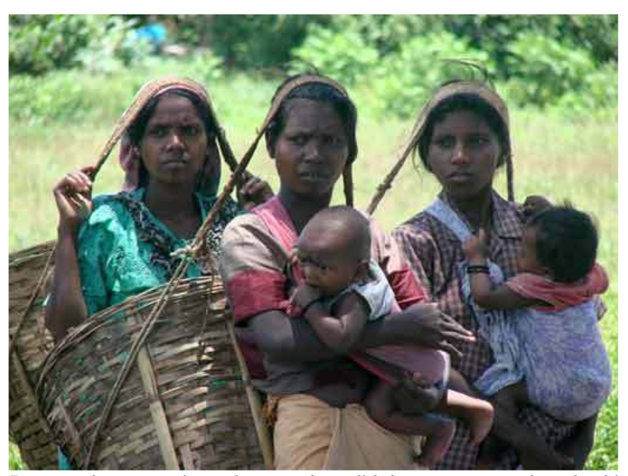
Insecure but protective – there mothers did the same not too long back!

If the OMCs could have been organised from the bottom and were able to sell as a brand there could have been some benefits. Instead the OMCs function in almost all cases as suppliers of raw materials to 'bought leaf' plants. Hence it is merely a survival strategy beneficial to others but having no real future for workers.