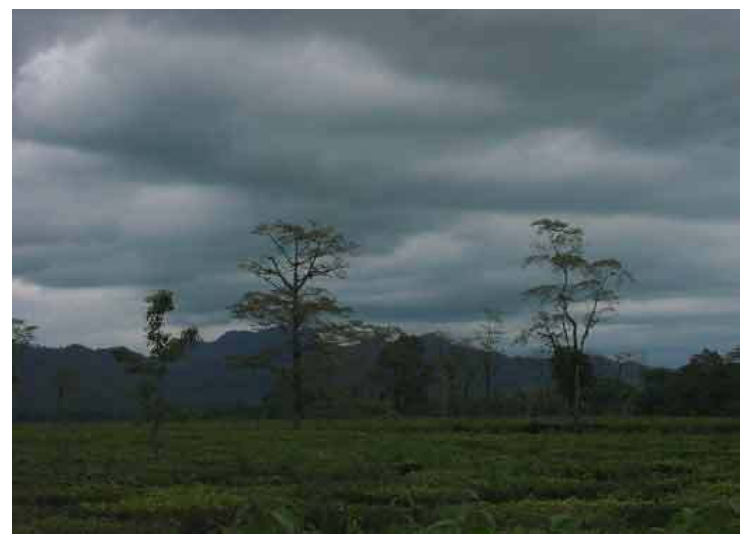
...missing the wood for the tree...

The crisis is much deeper than that of the closure of a unit. Focusing on reopening through providing finance is like missing the wood for the tree. Reopening by itself is important but it is probably not going to resolve the real crisis unless all the other problems are suitably addressed. The questions benignly enumerated in the last paragraph may seem academic to an observer but each of them are in fact loaded having direct bearing on some major problem or the other.