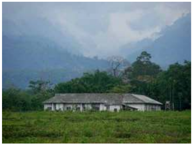
Samsing Tea Estate

However a whole lot of questions remain under the wrap. What about short-listing the chronically sick and / or closed tea gardens? What about a policy paper on them, being made public? What about the past management profiles of these units? What are their outstanding dues/loans? What are the policy decision regarding outstanding dues of these units? Who are the secured and unsecured creditors? Who are the present owners? What are their legal rights? What about a white paper with all the above answers?