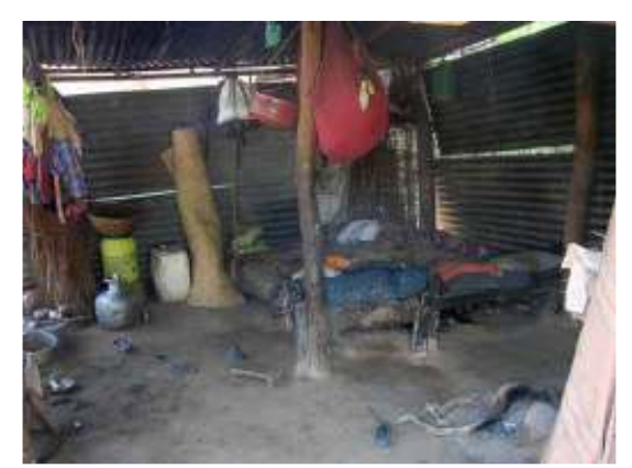
All five members who live in this room are TB patients

As stated before even for basic medical attention the villagers depend primarily on mobile health camps organised by urban NGOs functioning on a weekly basis, or travelling a long distance to the nearest Medical Health Centre.