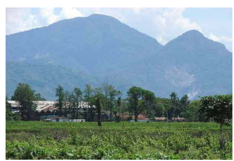
Degraded tea-garden and closed factory in the backdrop of Bhutan hills

Supported by state administration, banks and financial institutions, the next set of lease holders are prone to open, more often than not, the tea gardens only. As a result the tea plucking activities resume while the factory remains closed. When the flush come hectic activities mark the area but the factories become grave yards. Machines are removed as 'junk' while sponsored pilferage is rampant.