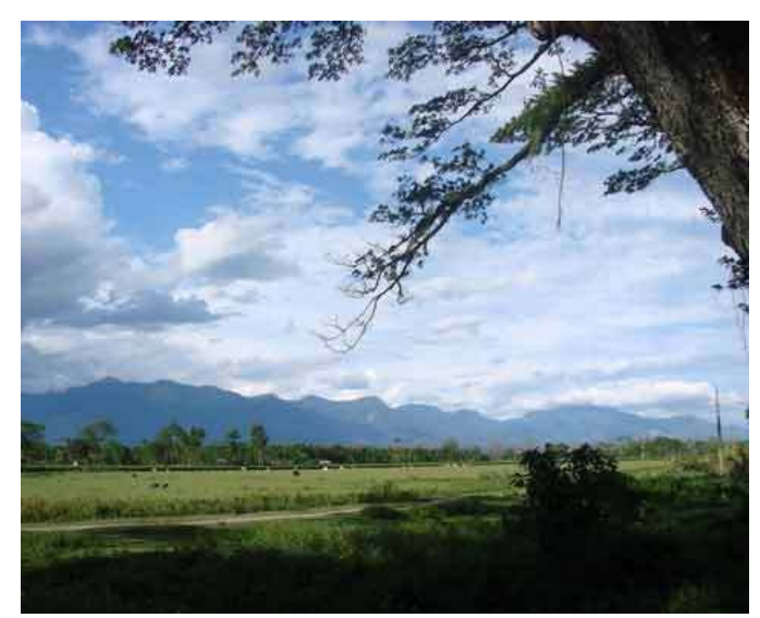
The Dooars: where millions suffer for hundreds of years!

West Bengal Land Reforms Amendment Bill was passed in the State Assembly in 2005. The purpose of the amendment to section 14 (z) was to clear the legal hurdles so that the land locked up in closed industries can be put to fair and proper use.