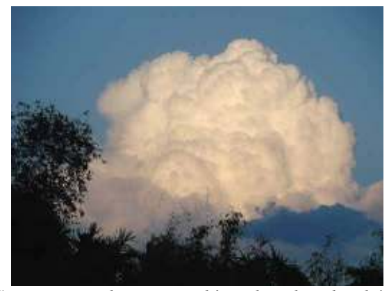
Sun rays on the approaching thunder clouds!

Some hard feelings are being generated since some key members of the OMC are also virtually controlling the 100 days of work under NREGA; various benefits through the General Relief Scheme, including food and medical relief, besides the work generated through OMCs. General opinion is that the workers are losing out, confused by the overlapping areas of these various schemes. However some are already in a position to explain how they are being cheated.