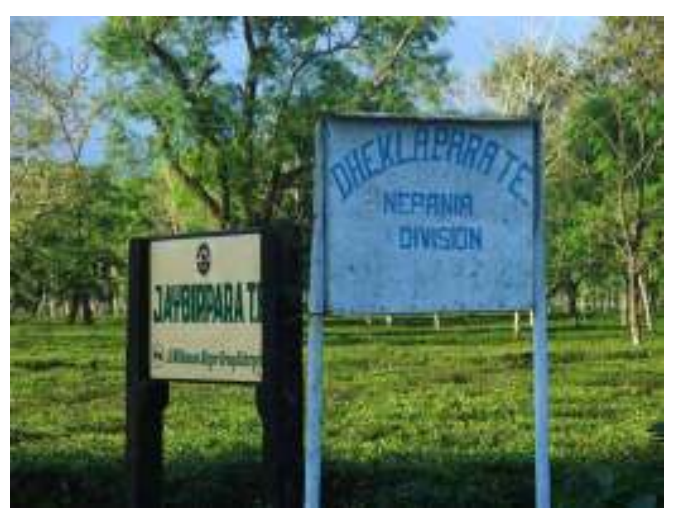
The beauty and the beast: Jaybirpara & Deklapara

the PLA (Plantation Labour Act). Only the wage package is being implemented but the wage is lower than that under PLA. This can only be ushered in if labour representatives are part of the management. Otherwise there would have been stiff resistance. Hence the Government too is perhaps looking at OMC-functioning as a test case. It may be pointed out that the owners have been saying since long that it is becoming non-viable to run tea gardens if they are to implement PLA in its entirety. It is not desired to glorify the PLA, but replacing it by a much inferior arrangement is not justifiable either.