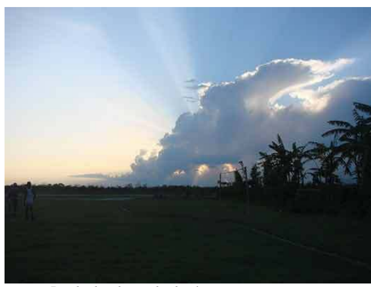
Dark clouds on the horizon

On the surface it is greatly appreciated that the Central Government is making efforts to reopen sick and closed tea gardens and factories. This focus and support from our Union Government is indeed laudable. However it seems that the tea industry in North Bengal is affected by the same disease which started affecting the Jute Industry in South Bengal a couple of decades back. It is not in crisis or distress and is far from being a 'sunset' industry as we are made to believe. The crisis is that of ownership.