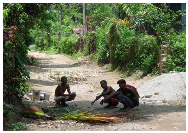
Who is responsible now for these 'villages'?

The residential spaces within and around the tea gardens are primarily villages. Only recently (around 2003) they have been brought under the purview of the Panchayat system but very little infrastructure seems to have been created which could benefit the inhabitants. The Panchayat, in general, shun any responsibilities towards the rural citizenry on the plea that that the PLA covers the tea-workers. On the ground level the PLA for all practical purposes is more of a myth! Whether the forthcoming amendment will make any difference is to be seen. Moreover with each passing generation the proportion of non-workers in these villages is soaring. But the debate still rages!