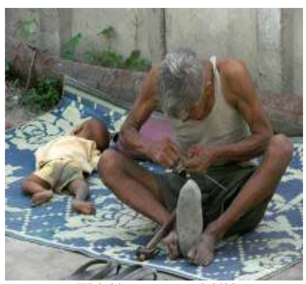
With his great-grandchild

Very little efforts are taken to provide employment in 'non-tea worker' villagers located near tea gardens. Grass root non-party organisations have been formed which are engaging with the Panchayat demanding job opportunities.