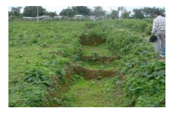
NREGA: Tanks and trenches no one knows for what!