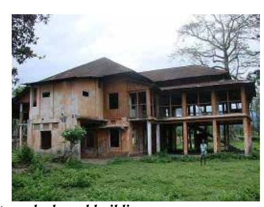
Veritable graveyard of dilapidated factory sheds and buildings