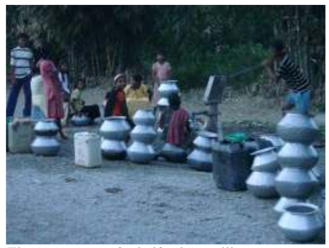
The water source for half a dozen villages

In some areas which are adjacent to these sick and closed tea gardens an additional problem is that of water scarcity. A common sight was that of scores of cycles laden with 20 to 75 litre containers winding their way to the nearest reliable water point almost five kilometres from the villages. That too, twice a day. It is unbelievable that with all the attention including that from the media, that these areas get during the 'annual-starvation-death seasons' such acute crisis is taking so many years to be addressed effectively.