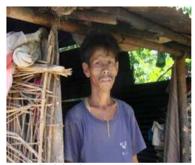
Each face has a story to tell!

machinery in tea processing plants; about introducing new machines in factories and so on. "Nobody cares about the real things!" the hushed voices exclaimed. "They know what needs to be done – but they don't bother!"