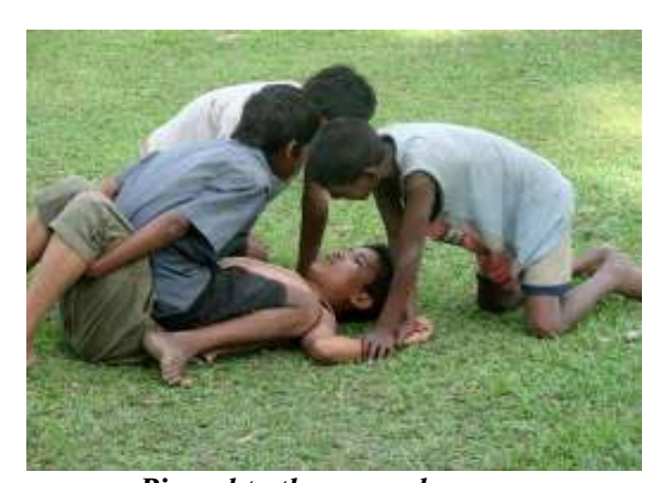
Pinned to the ground ...